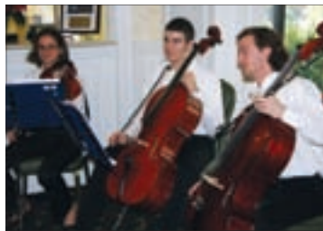
Beautiful music was provided by the Chatham High String Ensemble.

As over 275 friends and family gathered for the day's event they were greeted