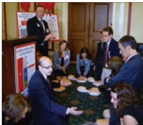
Sudden Cardiac Arrest Coalition members and winners of the Outstanding Achievement in SCA Awareness Award practicing CPR.

While in Washington, the SCAC awarded their Outstanding Achievement in SCA