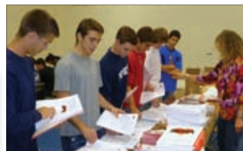
Members and volunteers of The Pingry School Heart Club work on the foundation's fall mailing.

Students from The Pingry School continue to support the Foundation through fundraising initiatives and preparing informational mailings. The club also held two bake sales during the school year which raised over $800.00 to support AED placement and training initiatives.