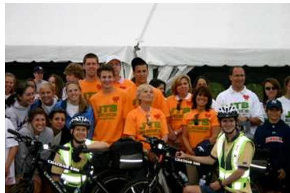
Fund raising events - Villanova University and The Pingry School JTB Heart Clubs